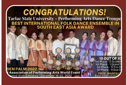
TSU dance troupe bags 10 awards in Dubai performing arts competition Page 6