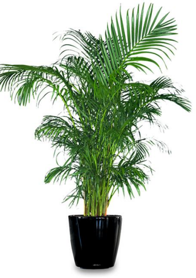
3 ft. Palmera Plant