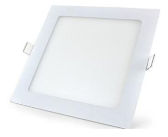
12W Square LED Recessed Panel Light