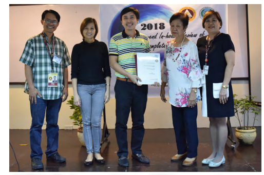
URO Releases List of Winners in December 2018 Review of Researches