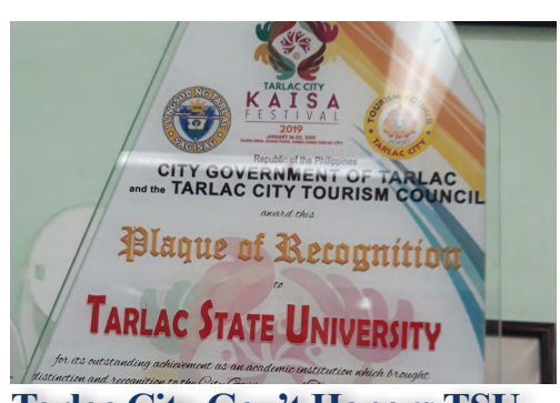
Tarlac City Gov't Honors TSU With Plaque of Recognition