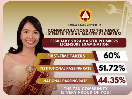
TSUian mechanical engineer places 6th in master plumber boards