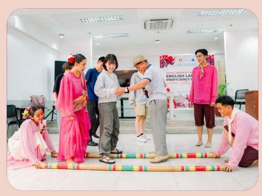
TSU welcomes 13 Japanese students for academic, cultural interchange