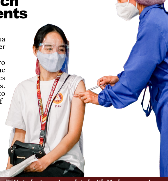
TSU student was inoculated with Moderna vaccine during the CHED Padyak vaccination program.

Tarlac province is the first in Northern Luzon to vaccinate students under this CHED program following the vaccination for student-athletes last October 20 at the CHED auditorium in Quezon City and tertiary students in Cabuyao, Laguna.