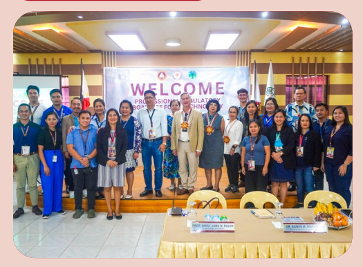
TSU, PRC food technology professionals strengthen food tech program through monitoring