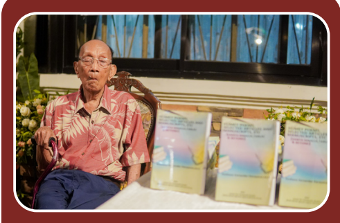
Retired TSU graduate school professor launches 2nd book about Santa Ignacia town Page 4