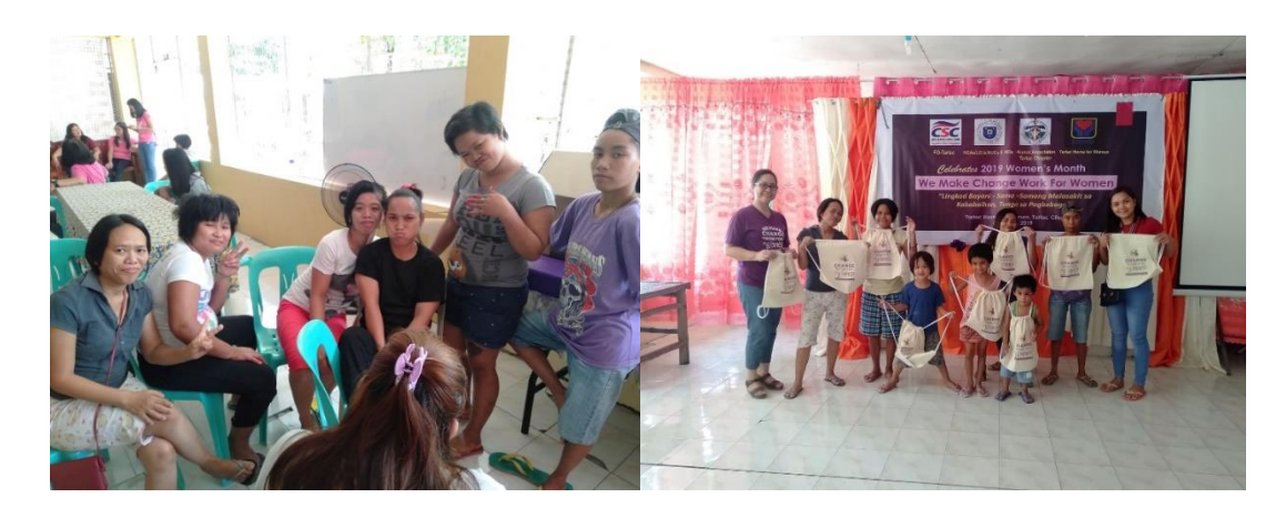
2019 18-Day Campaign to End Violence Against Women (VAW)

Another activity that the Gender and Development Office has conducted as part of their activity is the extended Serbisyo Para Kay Juana for the residents of Tarlac Home for Women held last March 29, 2019, at Provincial Hospital Compound, San Vicente, Tarlac City. Likewise, string bags were also given to the residents of Tarlac Home for Women.