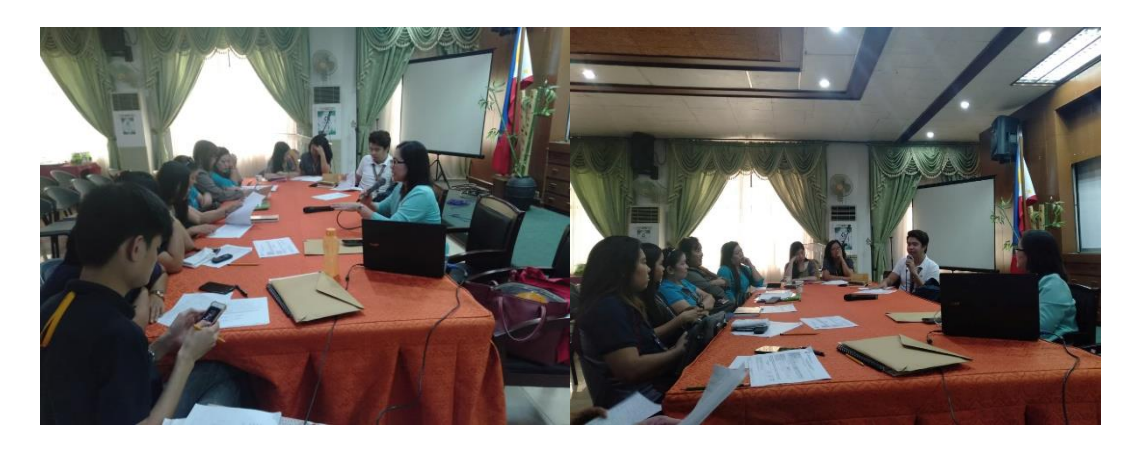
Seminar on the "Canons of Ethics in Public Service: A Must Towards an Accountable Governance

As a major aspect of its proceeding efforts to give technical assistance on the preparation of the Gender and Development (GAD) Plan and Budget and the GAD Accomplishment Report of the Tarlac State University, the Gender and Development Office along with College and Office GAD Coordinators conducted a session on "Gender and Development (GAD) Planning and Budgeting". The purpose of the session was to finalize the 2018 Gender and Development (GAD) Accomplishment Report and 2020 GAD Plan and Budget in compliance with the requirements of the Commission on Higher Education (CHED), Commission on Audit (COA) and the Philippine Commission on Women (PCW).